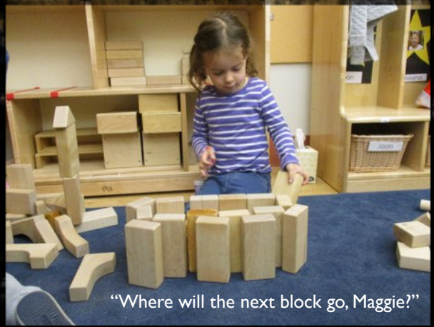
"Where will the next block go, Maggie?"